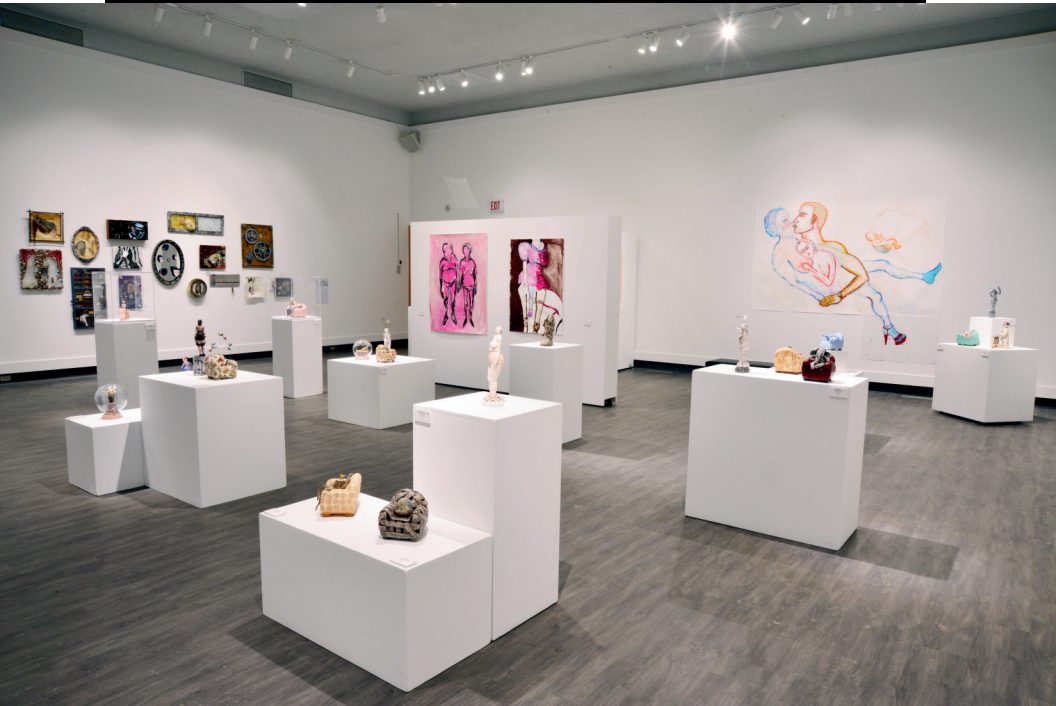
image: /// installation view, 2025.