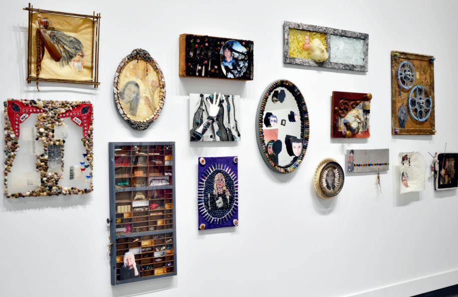
image: installation view of The Golden Salon , Sheila Nourse, 2025.

highlighting how society discards older women. Potter also illustrates elderly women's heart-breaking loss of agency, who are swallowed up by oversized armchairs, tucked into bed with baby dolls, and futilely grasping at balloon strings in her work.