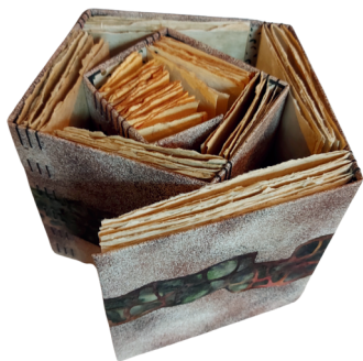
image: We Are All Connected , Bonnie McBride. Outside the Box Display Case The Disley Book-Arts Guild Open & Shut

individual work, but also forms an overarching story when all 100 are viewed together. Over time, squares that are purchased or given away will be replaced with new squares with different images, and the story will evolve.