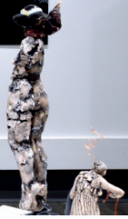
images (top and bottom): installation views of wall works by Leesa Streifler and sculptures by Deb Potter.