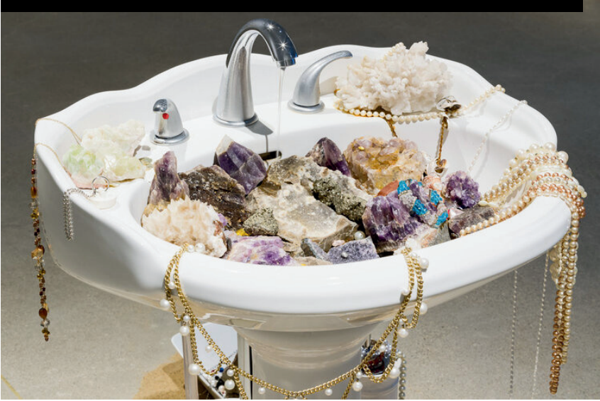
image: Dream Come True (detail of installation), Cindy Baker, image provided by artist.