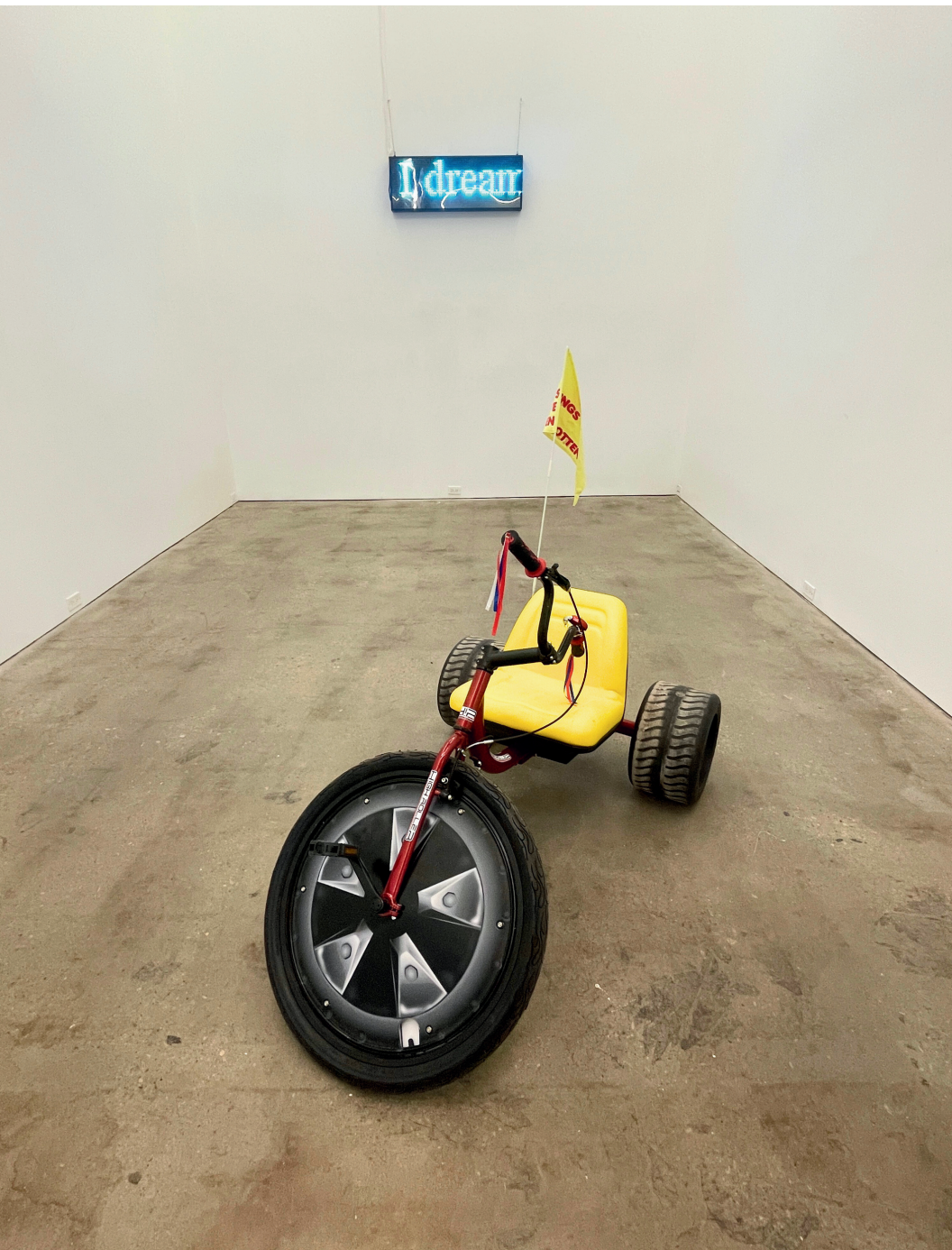
image: Things I've Forgotten (installation detail), Cindy Baker, image courtesy of the artist.